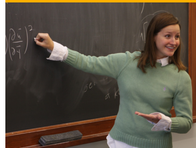
Training future teachers