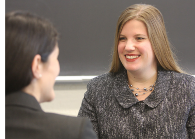
Providing mentoring opportunities